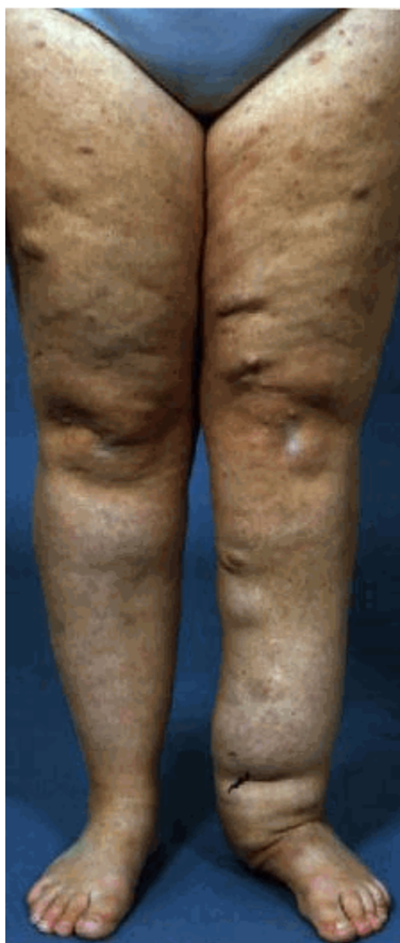
Figure 3. Plexiform neurofibroma