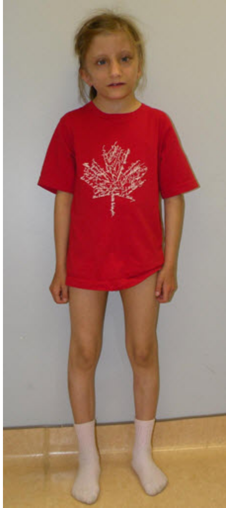
Figure 3. Frontal view of the girl in Figure 1. She has proportionate short stature with height <3rd centile.

sequence analysis first. If no pathogenic variant is found, perform gene-targeted deletion/duplication analysis to detect intragenic deletions or duplications.