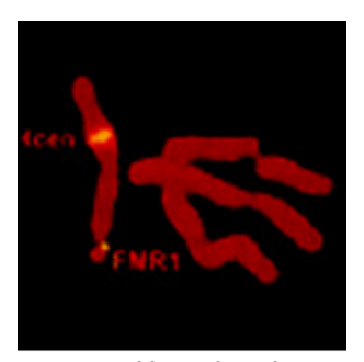
An unstable nucleotide repeat is associated with the most common form of mental retardation known as Fragile X syndrome.

Fragile X syndrome is the most common inherited form of mental retardation currently known. Fragile X syndrome is a defect in the X chromosome and its effects are seen more frequently, and with greater severity, in males than females.