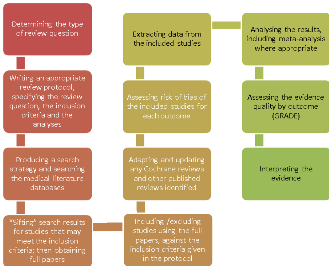
Figure 1: Step-by-step process of review of evidence in the guideline

Sections 2.1 to 2.3 describe the process used to identify and review clinical evidence (summarised in Figure 1), sections 2.2 and 2.4 describe the process used to identify and review the health economic evidence, and section 2.5 describes the process used to develop recommendations.