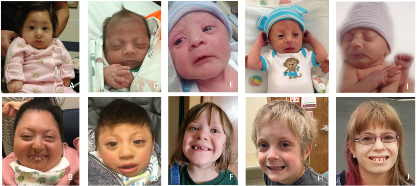
Figure 2. Facial phenotype of RNU4atac-opathy

Craniofacial features vary, with a more consistent and notable gestalt associated with the more severe end of the RNU4atac-opathy spectrum, whereas features seen in the mild/moderate range of the spectrum are more variable. In addition to microcephaly and dolicocephaly, individuals with microcephalic osteodysplastic primordial dwarfism type I/III (MOPDI) have a sloping forehead and ridged metopic suture at birth. The eyes are prominent and appear large; the nasal root is high and the nasal bridge is broad. Lips tend to be full and chin is micrognathic. Ears tend to be small, low set, and posteriorly rotated [Taybi & Linder 1967, Winter et al 1985, Sigaudy et al 1998, Edery et al 2011, Abdel-Salam et al 2012, Kilic et al 2015].